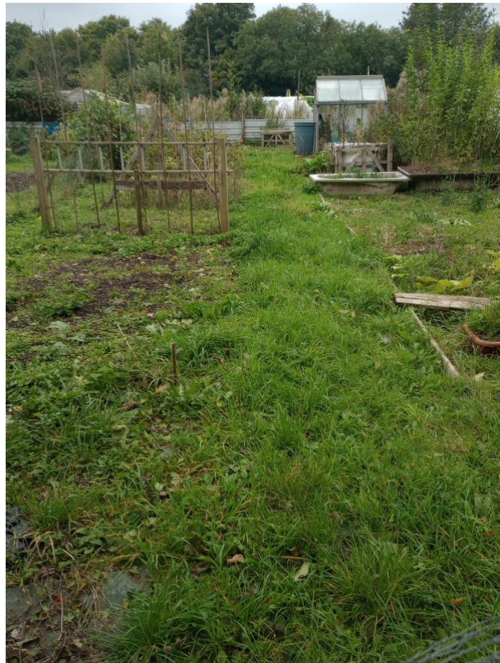
Not a lot happening.