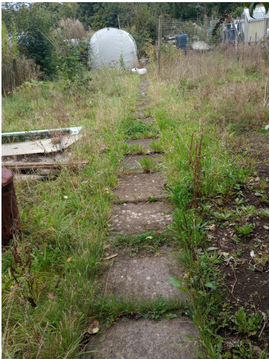
Not a lot happening.