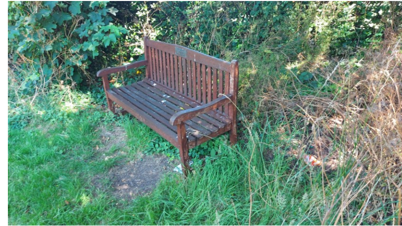
E – Memorial Bench