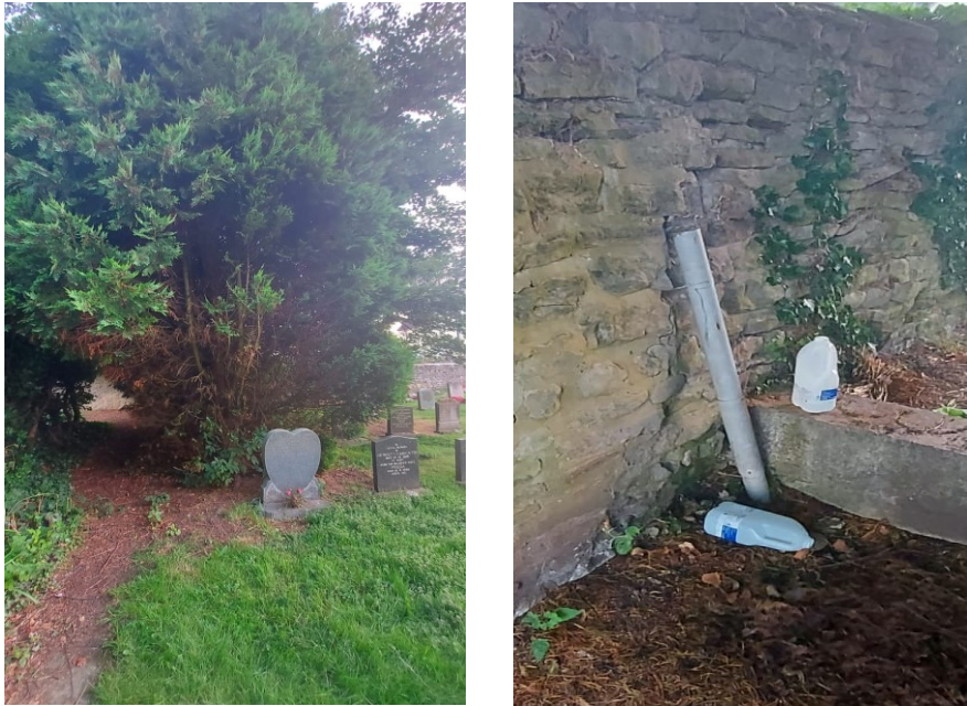
D – Water Standpipe