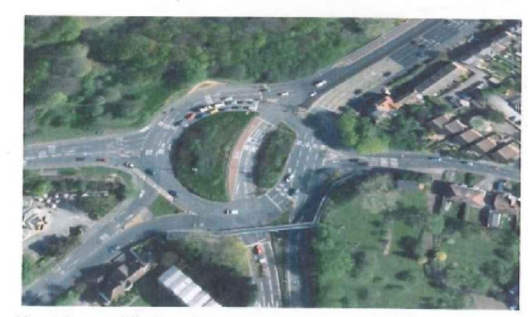
3. Possible Improvement

Contains Ordnance Survey data © Crown copyright and database right 2016