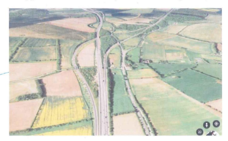
2. Typical Grade Separated Interchange