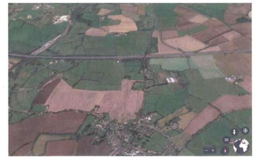
3. Current view of landscape