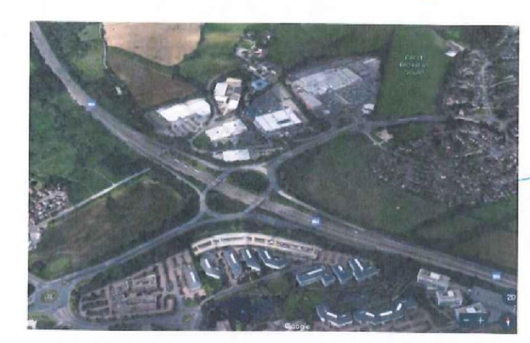
1. Typical M4 Interchange