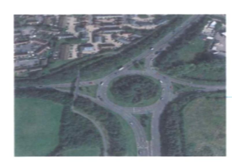
1. A420 Deanery Rdbt