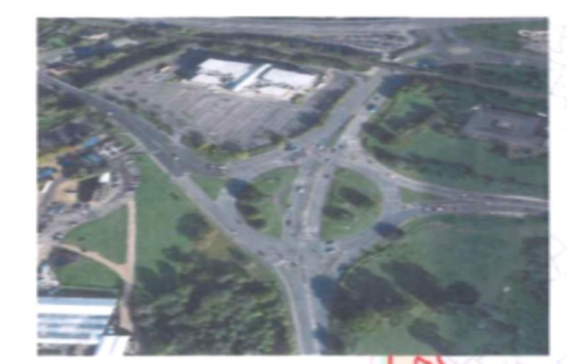
2. Possible Improvement