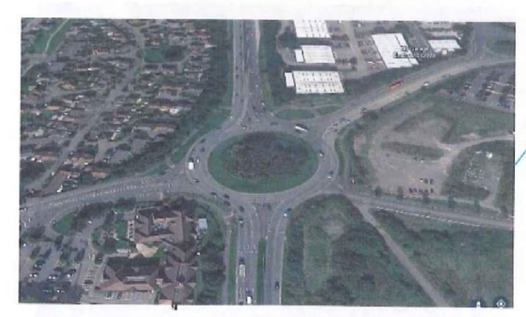
2. Lyde Green Rd Rdbt