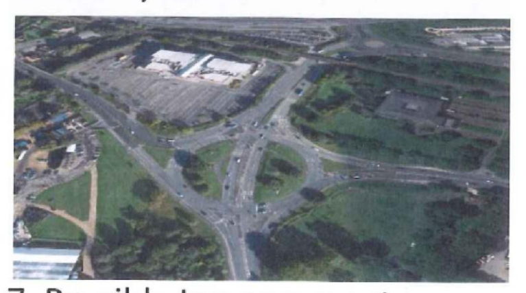
7. Possible Improvement