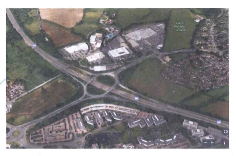
1. Typical Motorway interchange