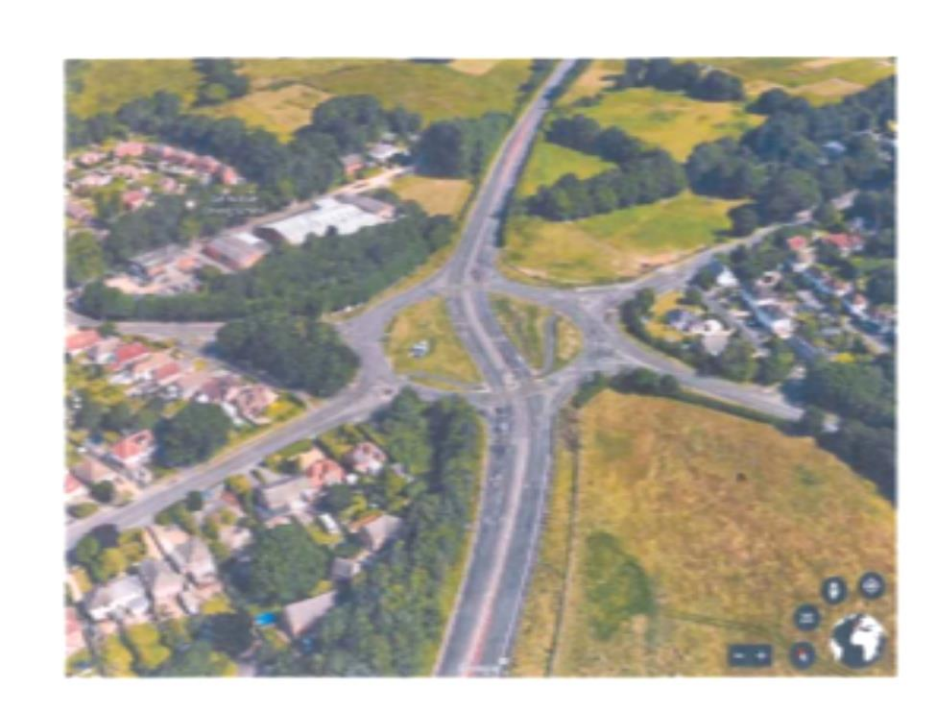
3&4. Typical images of a 'Throughabout'