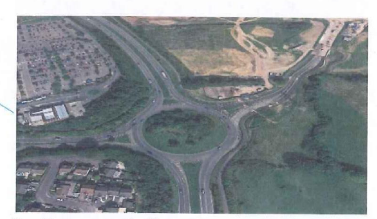
6. Rosary Rdbt