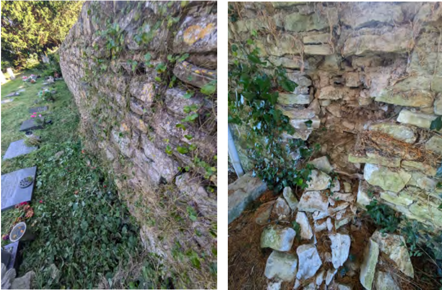
G – Old Stone Wall