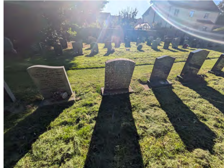
H & I – Headstones