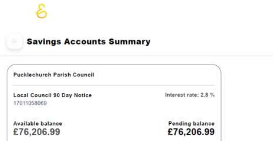
Figure 212 Hinkley and Rugby savings account as at 31/03/26