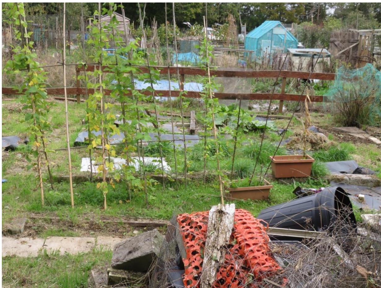
Some work done.