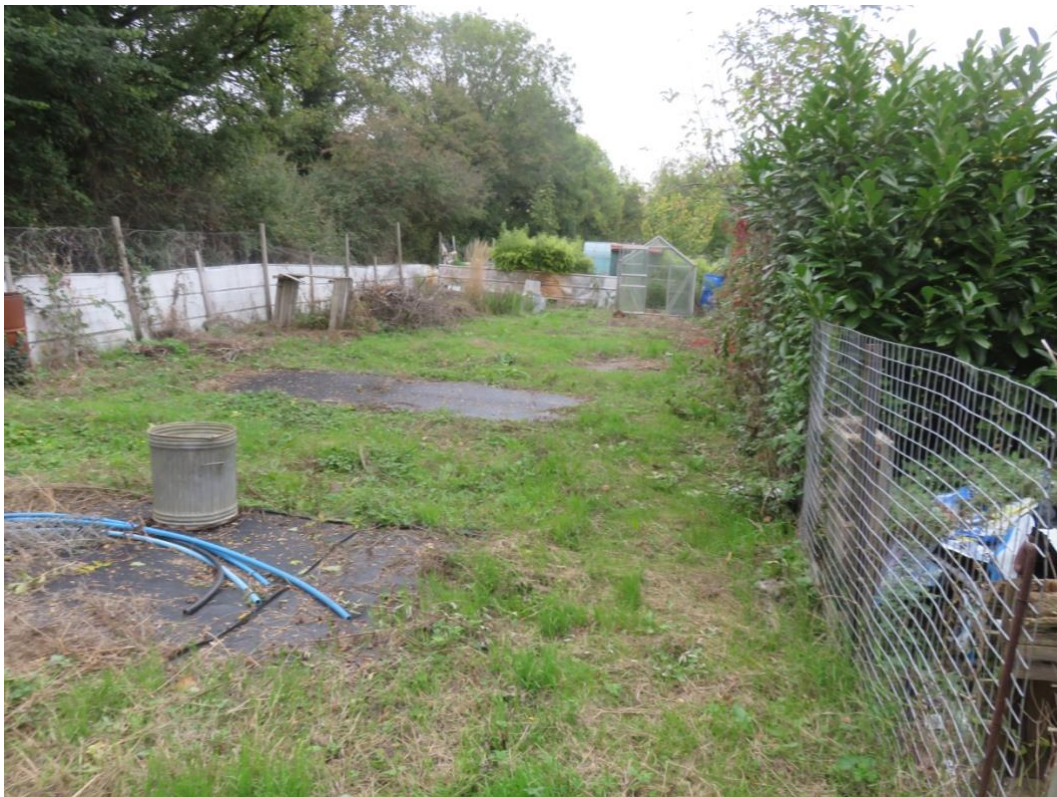
Not well used (recently strimmed by committee).