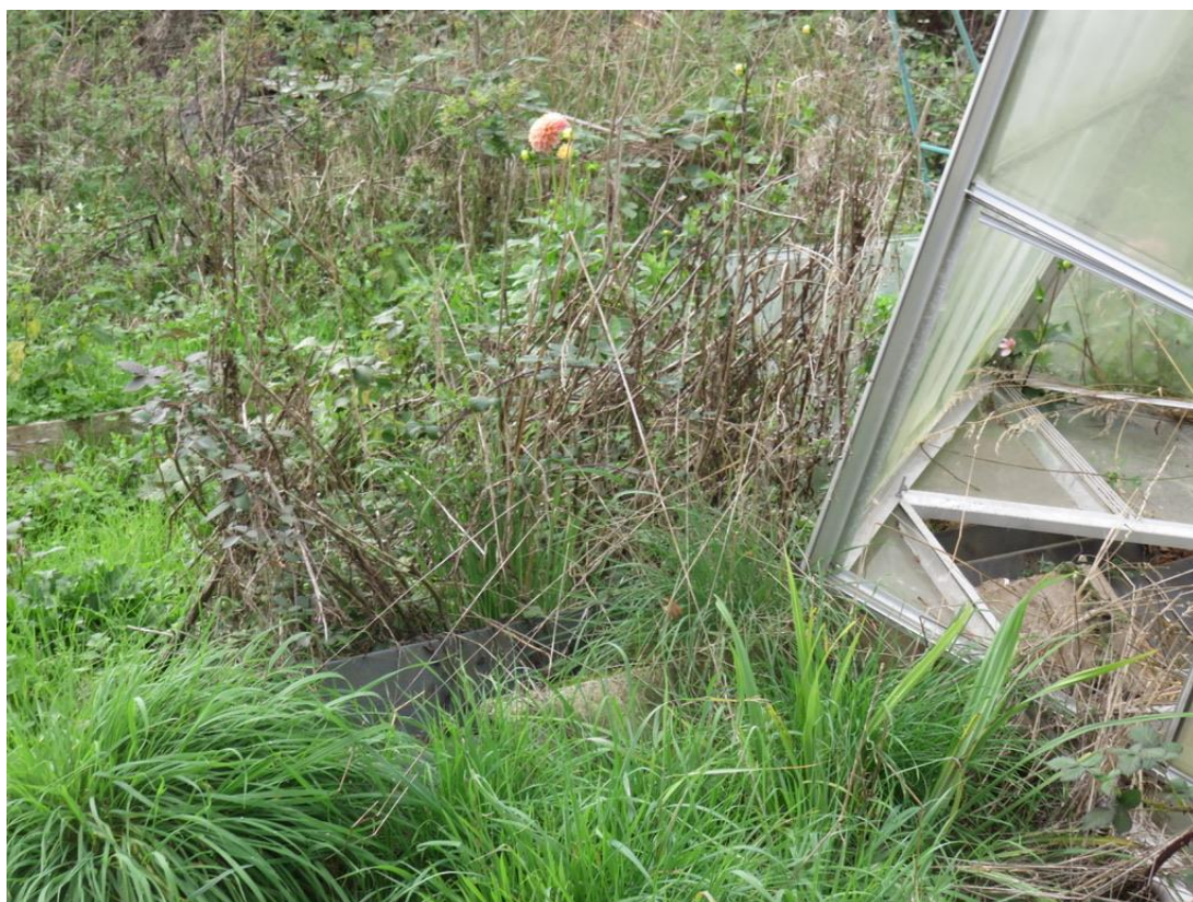
Not good, a mess.