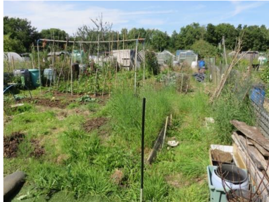
Work in progress.