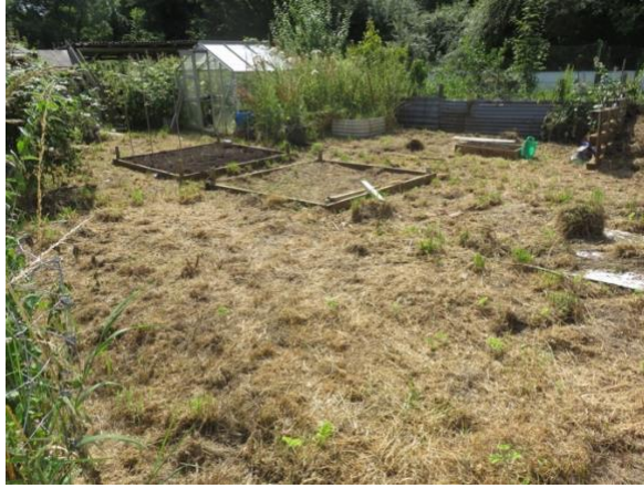
Being worked, not as good it was.