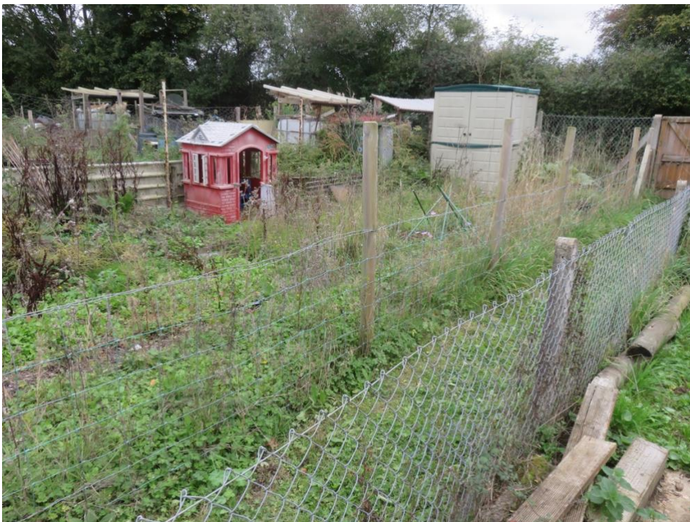
Not really improved.