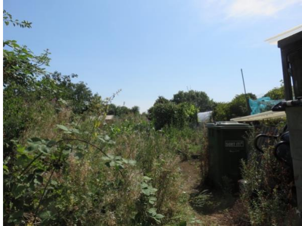
Not as good as it was.