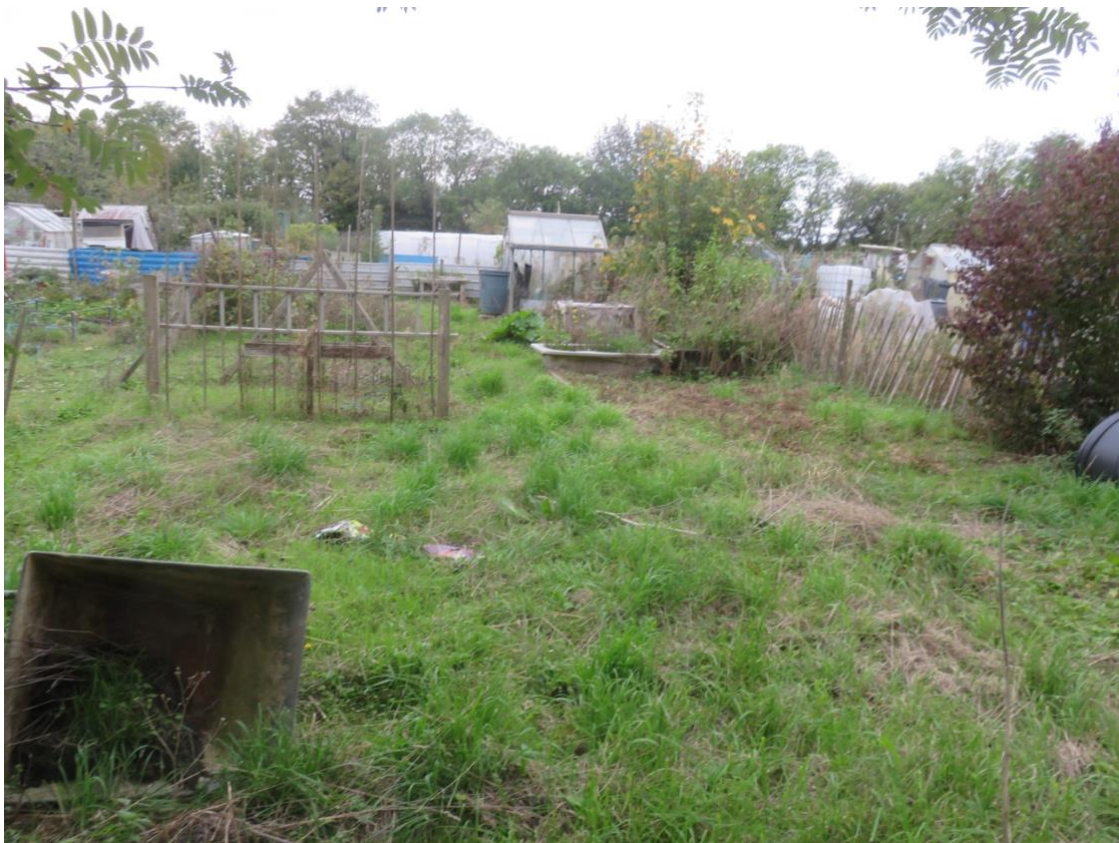
Work done by committee.