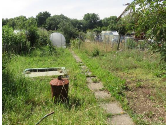
Not a lot happening.