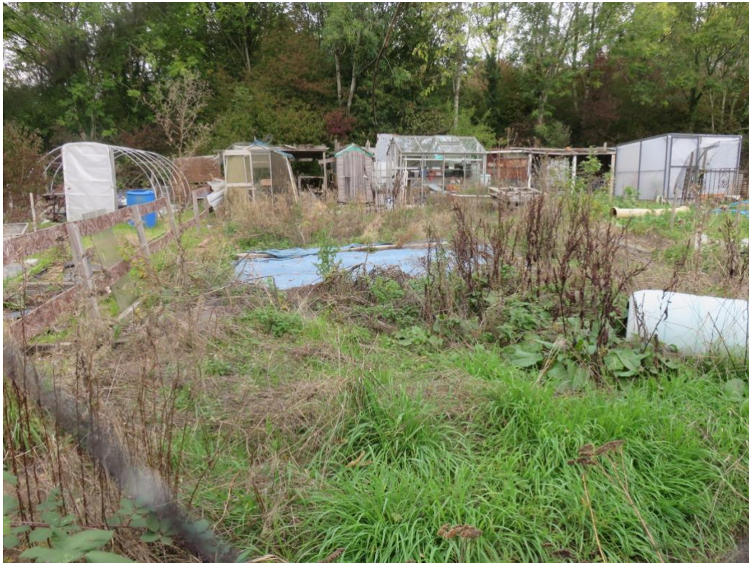
Overgrown (allotment holder may be moving away, thc).