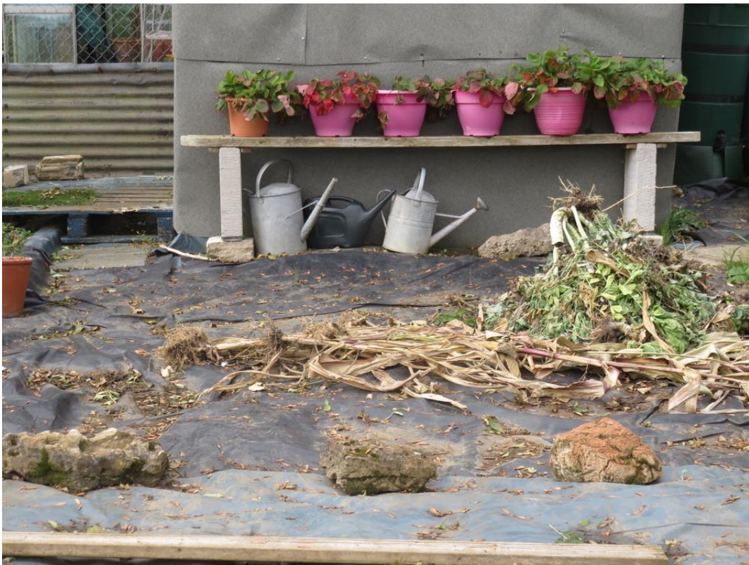
Shutting down for winter.